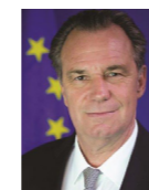
Renaud Muselier , President of the Provence-Alpes-Côte d'Azur Region, President of Regions of France

"The French presidency of the Alpine macro-region will allow us to strengthen the links between the Mediterranean and the Alps. I wanted it to include, in all of its priorities, the fight against climate change, in order to preserve the quality of life in our Alpine regions. In this year, 2020, of reworking European policies, we will provide a concrete form for the "Green New Deal": clean and sustainable transport, protection of our exceptional biodiversity, global prevention of natural risks ..."