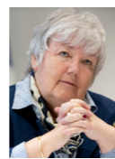
Jacqueline Gourault , Minister for Territorial Cohesion and Relations with Local Authorities

"The French presidency of EUSALP, which will take place under a framework of unprecedented governance that brings together the State and the Regions, presents a historic opportunity to provide a boost necessary for the ecological transition of the Alpine region. Together with our Alpine and European partners, by supporting city-valley-mountain cooperation, we can act effectively to fight against climate change and also work towards cohesion of the Alpine region."