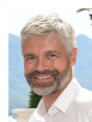
Laurent Wauquiez , President of the Auvergne-Rhône-Alpes Region

"At the Auvergne-Rhône-Alpes level, everything is in place to ensure that the exceptional heritage of the Alps is protected, and developed in a sustainable manner. We are investing massively to improve air quality, to develop hydrogen-powered transport, protect biodiversity, strengthen supply networks for our agriculture, guarantee a competitive and sustainable wood sector and, finally, economically develop our villages and our stations thanks, particularly, to planning and ecotourism. I am delighted that the French presidency of EUSALP 2020 shares this ambition. It will enable us, with all of our French and European partners, to meet the many challenges the Alpine massif currently faces, and to set an example at the European and international levels. We owe it to the 80 million inhabitants of the Alps today and, in the future, to all our children."