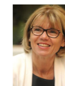
Christiane Barret , general delegate of the French presidency of EUSALP

With all of these national and local actors, the French presidency will endeavour to contribute to accelerating the ecological transition of the Alpine region, in order to fight against climate change.